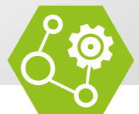
Intelligent Interaction System